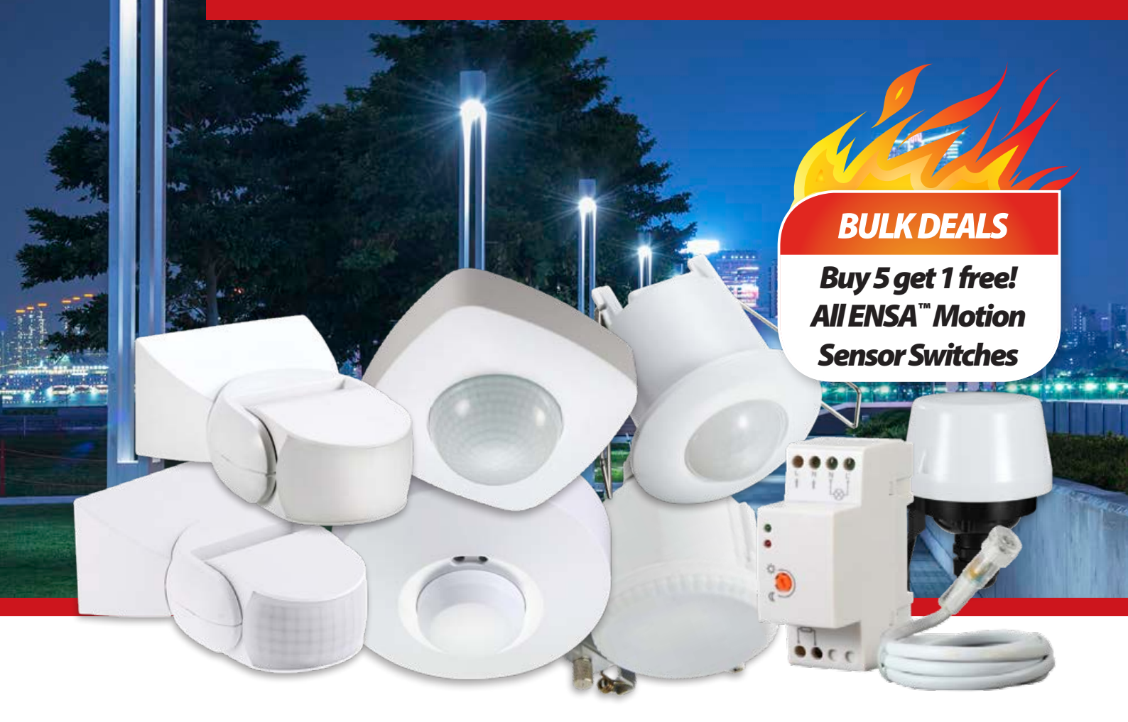
ENSA^{\tilde{}} Intelligent Motion Sensor & Dusk/Dawn Switches

Customise your lighting installations with adjustable light and movement sensing and on-timer delay.