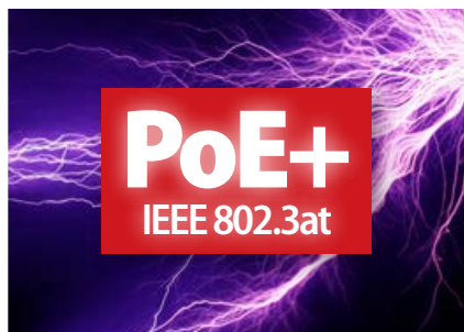
Supports 30W PoE per port