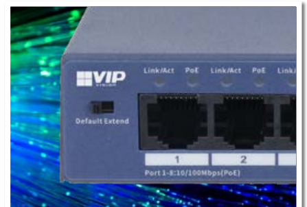
Extend up to 250m at 10Mbps