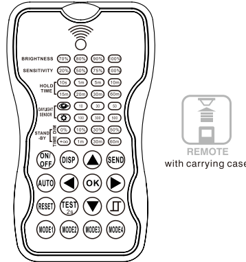
REMOTE with carrying case