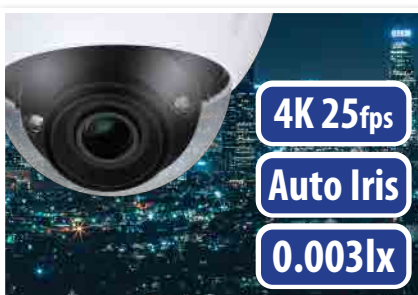
Superb Image Performance