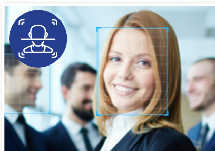
AI-Enhanced Face Detection