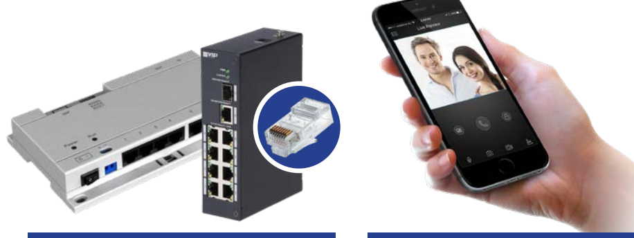
Connect & Power over Ethernet