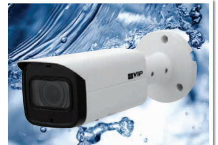
Weather & Vandal Resistance