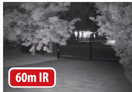
Long Range 60m Infrared