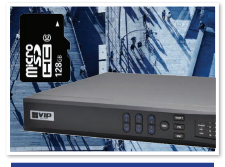
Recording via microSD or NVR