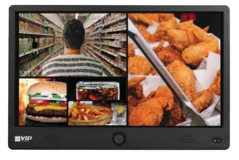
Configurable Signage Display