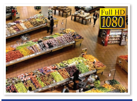
Live 1080p Camera Stream Display