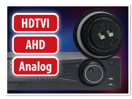
DVR Cross Compatibility