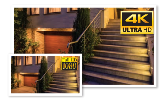
Ultra HD Recording Over Coax