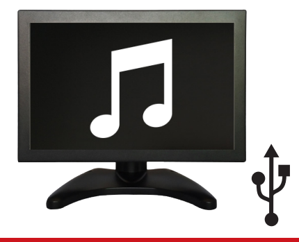
Play Music & Video Files via USB