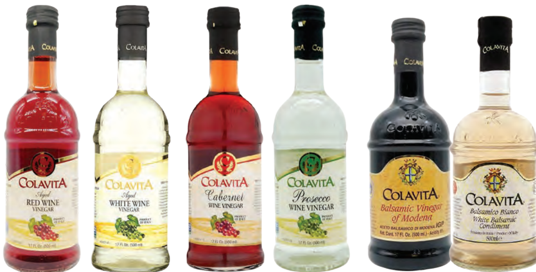
Red Wine Vinegar