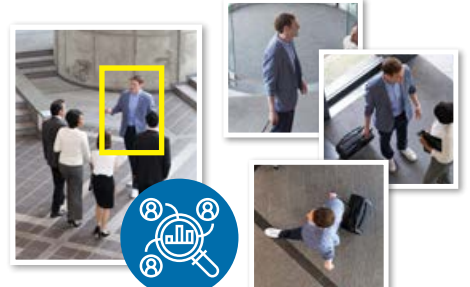
Quick Search via AI Event