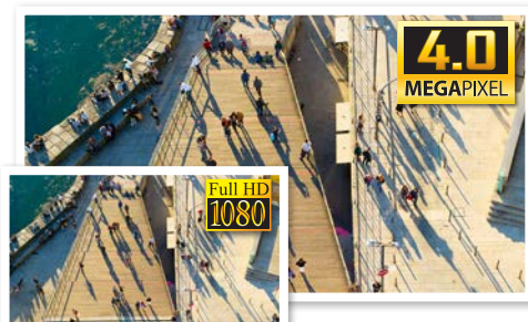
Record at 4K Ultra HD Resolution