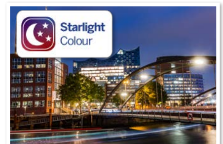
Superb Low Light Performance