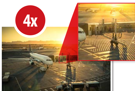
Up to 4x Optical Zoom