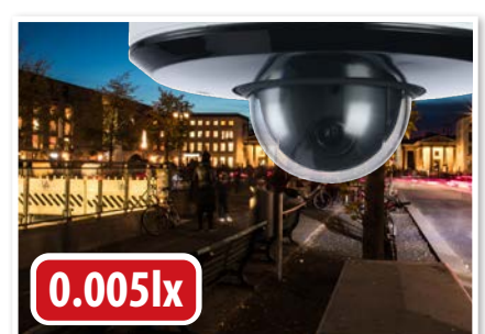
Superb Low Light Performance