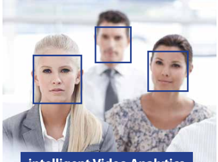
intelligent Video Analytics