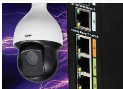
Hi-PoE Support for 60W Devices