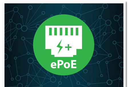
Extended PoE Range up to 800m