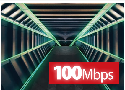
Fast 100Mbps PoE+ Device Ports