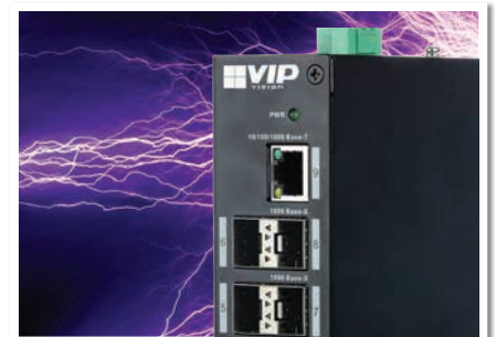
Overvoltage & ESD Protection