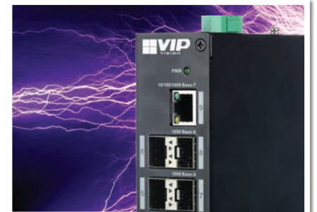
Overvoltage & ESD Protection