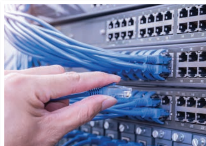
Plug & Play Unmanaged Switch