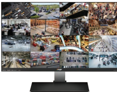
Expand up to 64 IP Cameras