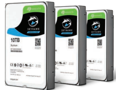
Versatile Storage & Backup