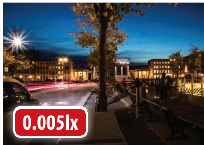
Superb Low Light Performance