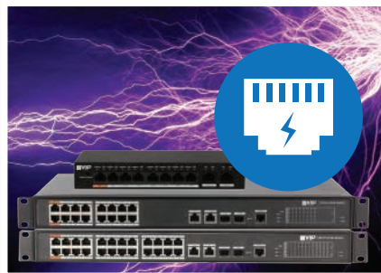
PoE+ and Hi-PoE Support