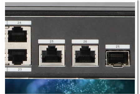
Gigabit (100M) Uplink Ports