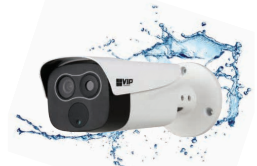
Compact, Water-Resistant Design