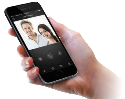
Two-way talk & Remote Unlock