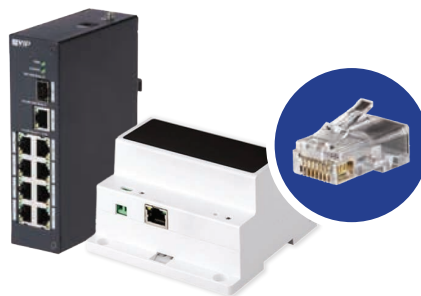
Add 2-Wire Systems to Network