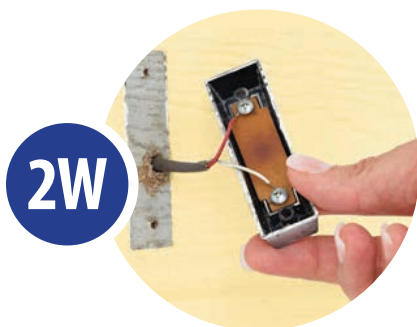
Upgrade Existing 2-Wire Systems