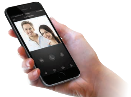
Two-way talk & Remote Unlock