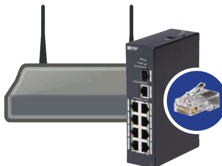
Connect via WiFi or Network Cable