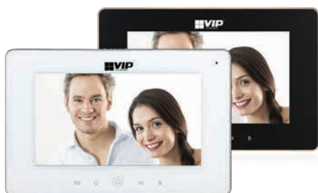
7" Slimline Touchscreen Monitor