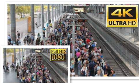
Record at 6.0MP Resolution