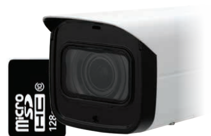
Edge Recording via MicroSD