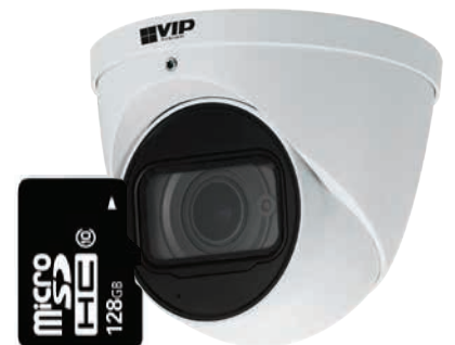
Edge Recording via MicroSD