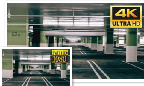
Record at 4K/Ultra HD Resolution