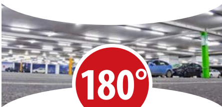
Wide Panoramic View & Infrared