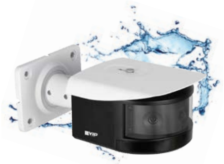
Vandal & Weather Resistant