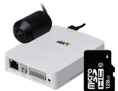
Edge Recording via MicroSD