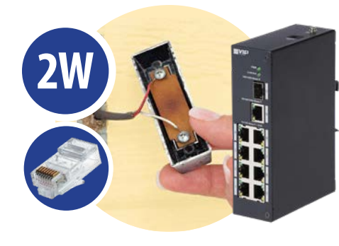
2-Wire or Ethernet Installation