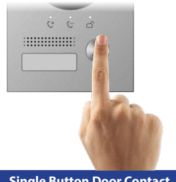
Single Button Door Contact